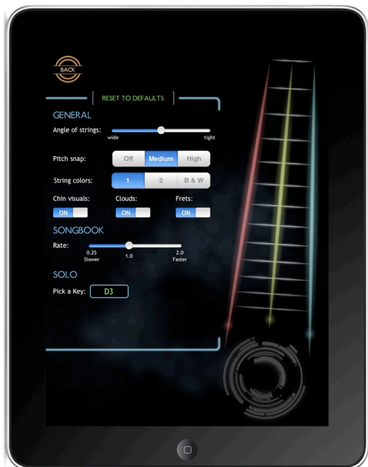
Figure 4. Customizing the fiddle.

The pitch of the lowest string to be used in the Solo mode can be set to any note between C2 and D4. When set to C2, the strings match the lower three strings on a cello, and when set to D4, the strings match the top three strings on a violin. Because the overall range of the instrument over the three strings is just over two octaves, allowing adjustments on the key makes it possible to cover a greater range of pitch, facilitating playing as an ensemble.