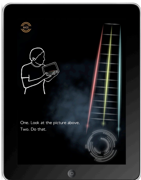
Figure 5. Magic Fiddle shows a user how it likes to be held.