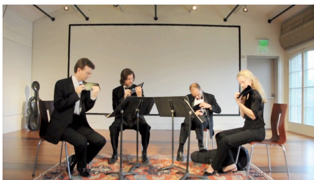
Figure 6. The St. Lawrence String Quartet on iPads.

The members of the St. Lawrence String Quartet 2 , an Ensemble in Residence at Stanford University, were among the first to try out Magic Fiddle. Their initial response noted the lack of tactile feedback on individual strings, and that the players missed the lateral curvature of the traditional instrument's neck. The ability to bow indefinitely was appreciated. Regardless of the many differences, these professional musicians picked up the instrument almost immediately, performing Pachelbel's Canon as an ensemble (Figure 6).