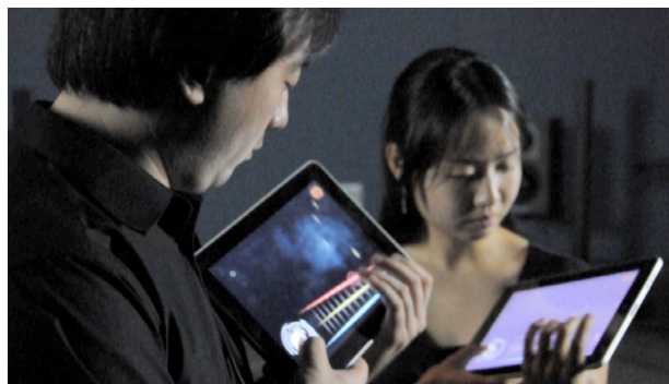
Figure 1. Playing a Magic Fiddle duet.